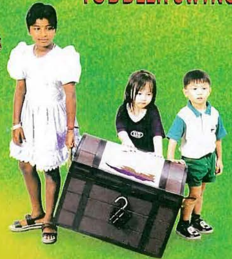
TOY TREASURE CHEST