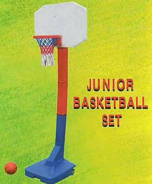
JUNIOR BASKETBALL SET

GREATER VALUE IN PLAY. THAT IS WHAT FUNSHAPES TOYS ARE MADE FOR. WITH FUNSHAPES YOUR CHILDREN GET THE EXERCISE THEY NEED TO BUILD A STRONG BODY AND A SOUND MIND. THEIR STAMINA, AGILITY, COORDINATION AND BALANCE ARE IMPROVED. THE SOCIAL SKILLS AND MENTAL ABILITIES ARE ENHANCED. AND ALL THESE HAPPEN WITH FUN. YOUR CHILDREN GROW STRONGER, SMARTER AND HAPPIER.